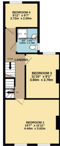
2ND FLOOR 206 sq.ft. (19.1 sq.m.) approx.