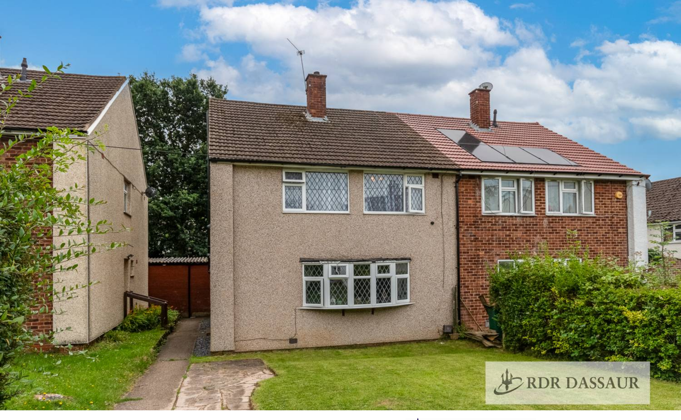
6 Bliss Close, Coventry Coventry