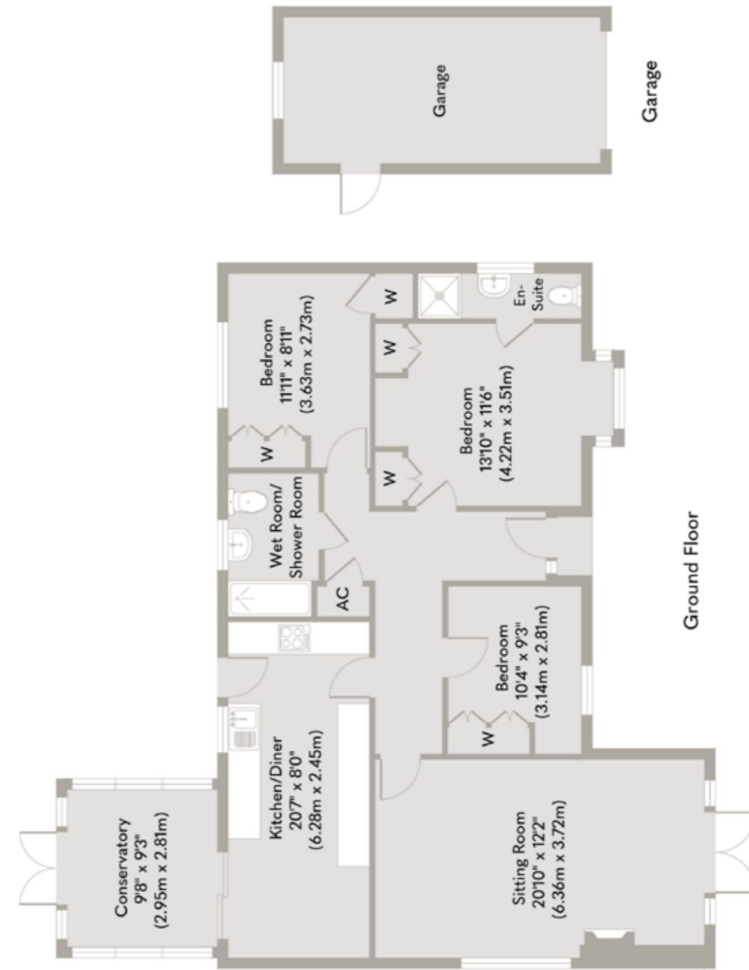
Approx. Gross Internal Floor Area 1,107 sq. ft. (102.81 sq. m)

Whilst every attempt has been made to ensure the accuracy of the floor plan contained here, measurements of doors, windows, rooms and any other items are approximate and no responsibility is taken for any error, omission, or mis-statement. This plan is for illustrative purposes only and should be used as such by any prospective purchaser or tenant. The services, systems and appliances shown have not been tested and no guarantee as to their operability or efficiency can be given.