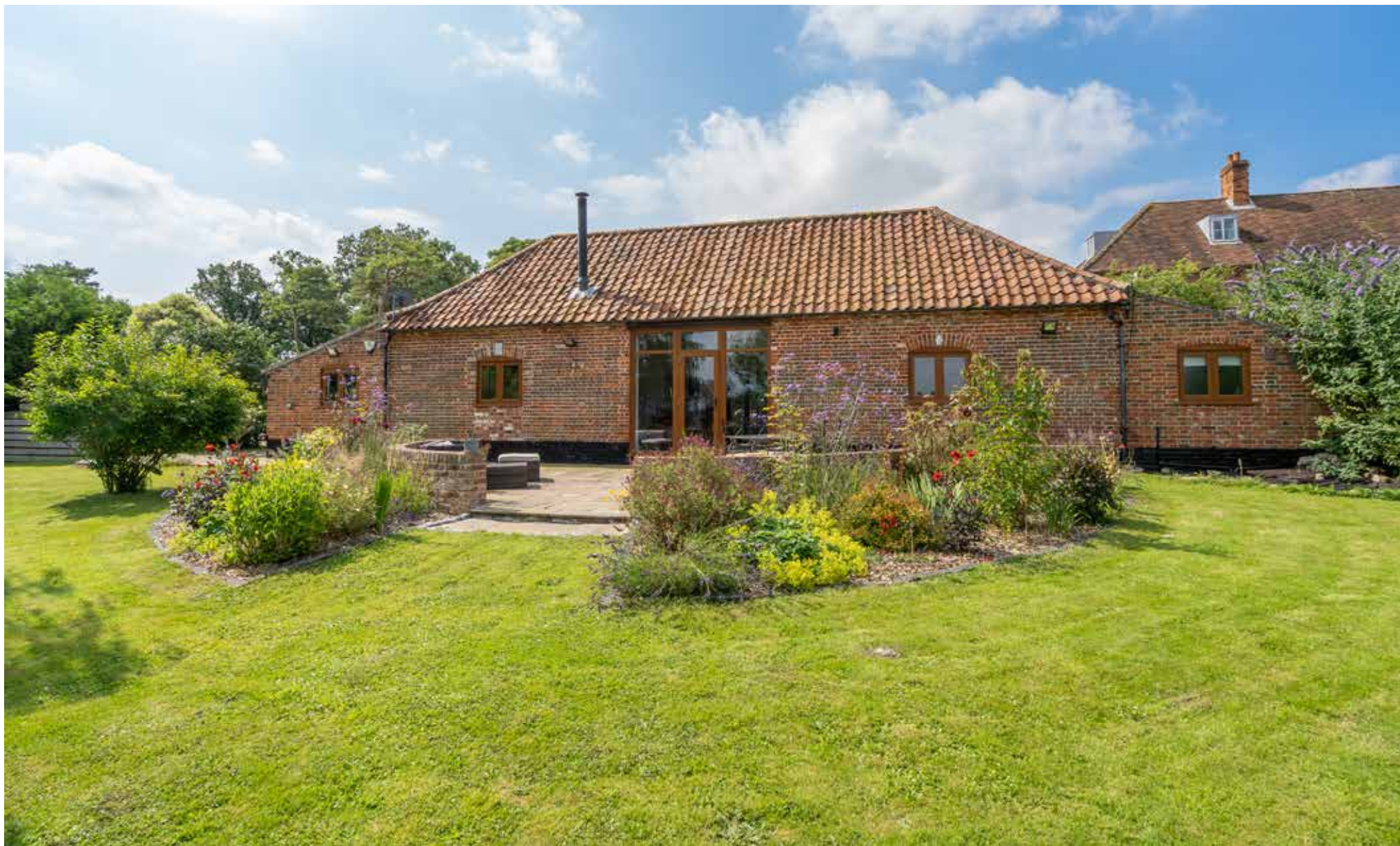
The Pump House Viewpoint | Shipmeadow | Suffolk | NR34 8EX