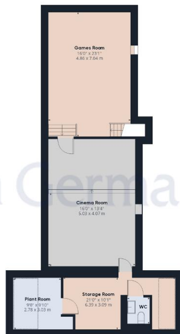
Floor 2 Building 1