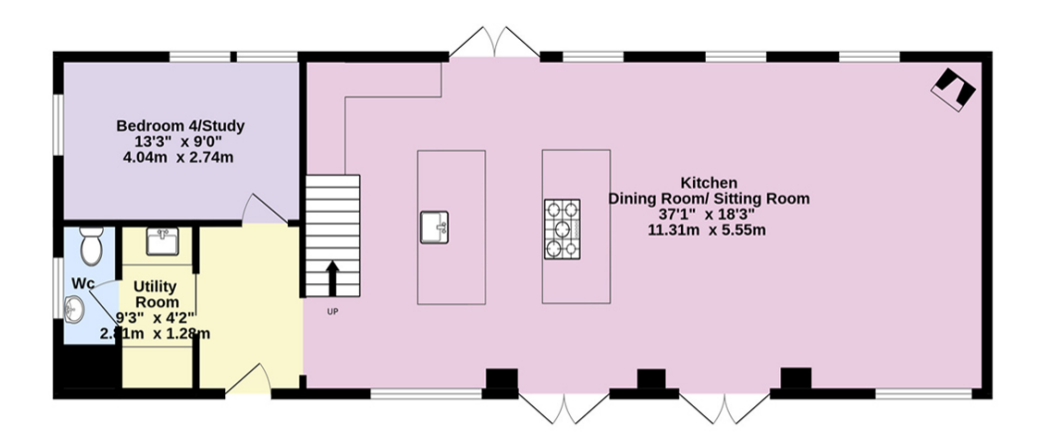
1ST FLOOR 918 sq.ft. (85.3 sq.m.) approx.