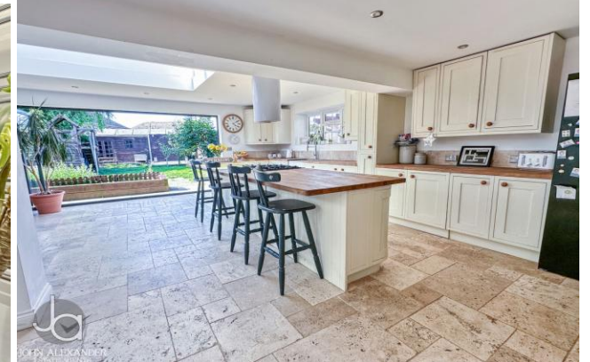
Ford Lane, Alresford, Colchester, CO7 8AS