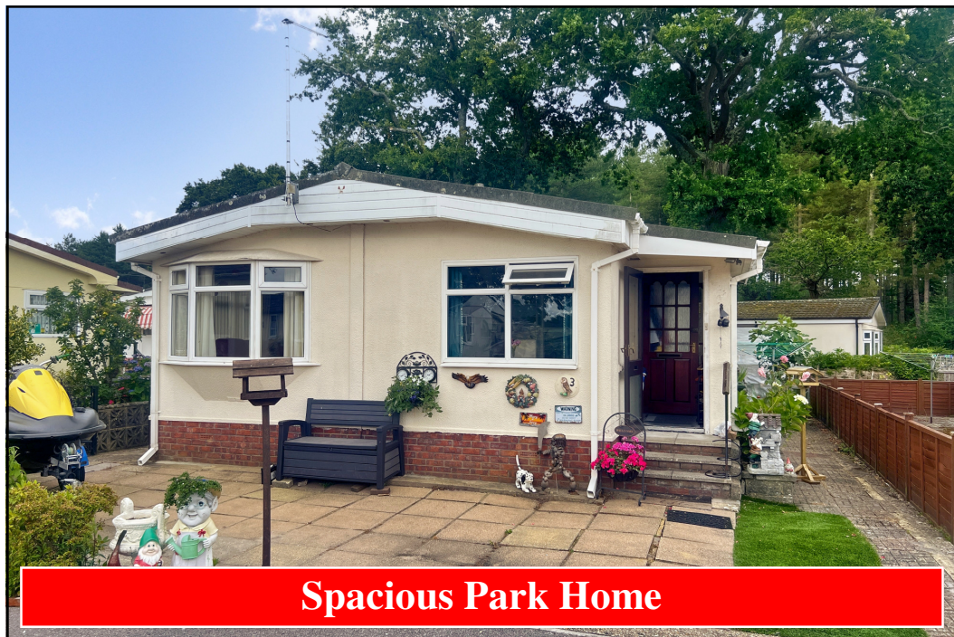
Spacious Park Home

3 The Paddock, Oaktree Park, St Leonards, Nr Ringwood. BH24 2RW