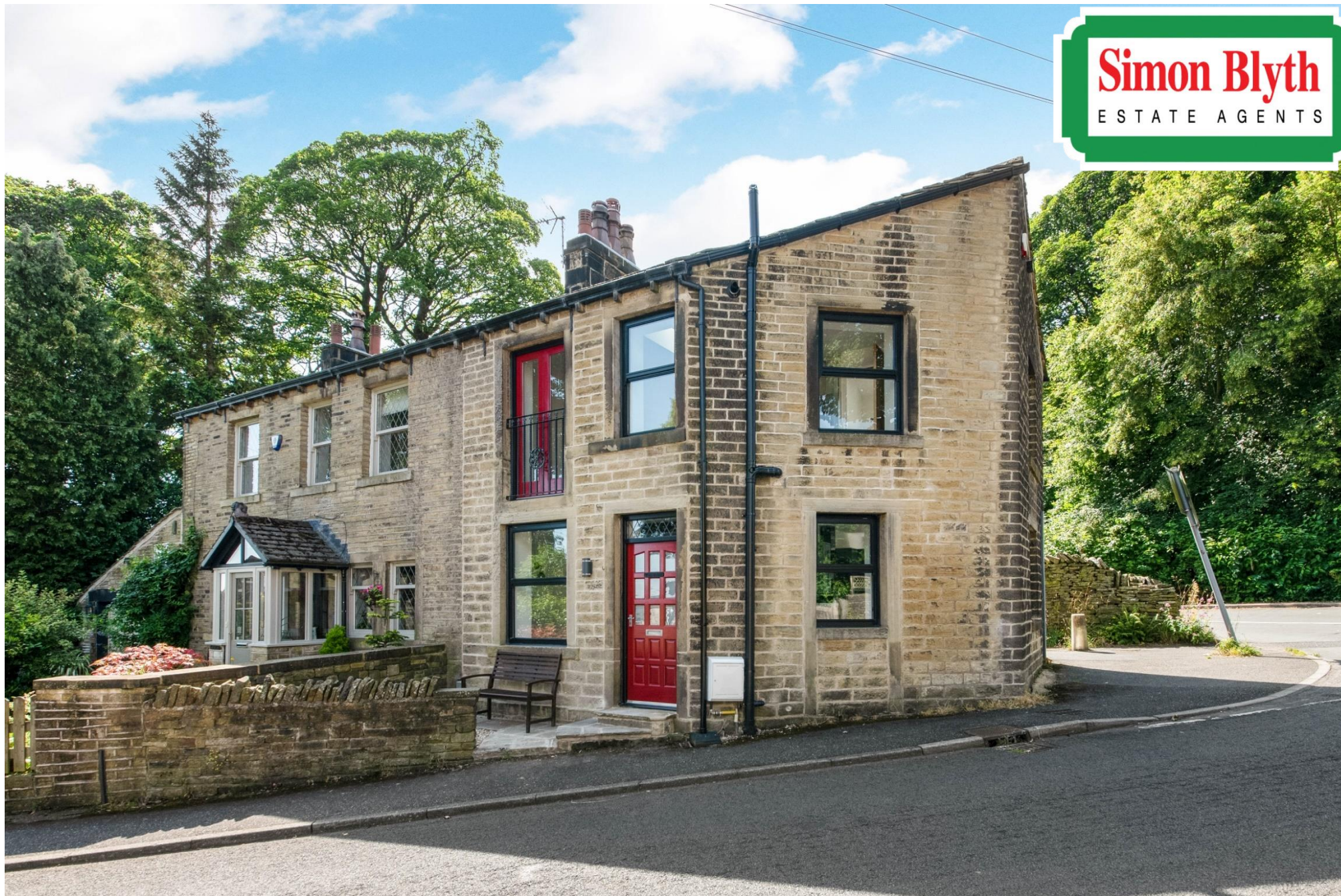
TOLL HOUSE, WESSENDEN HEAD ROAD, HOLMFIRTH, HD9 4ET