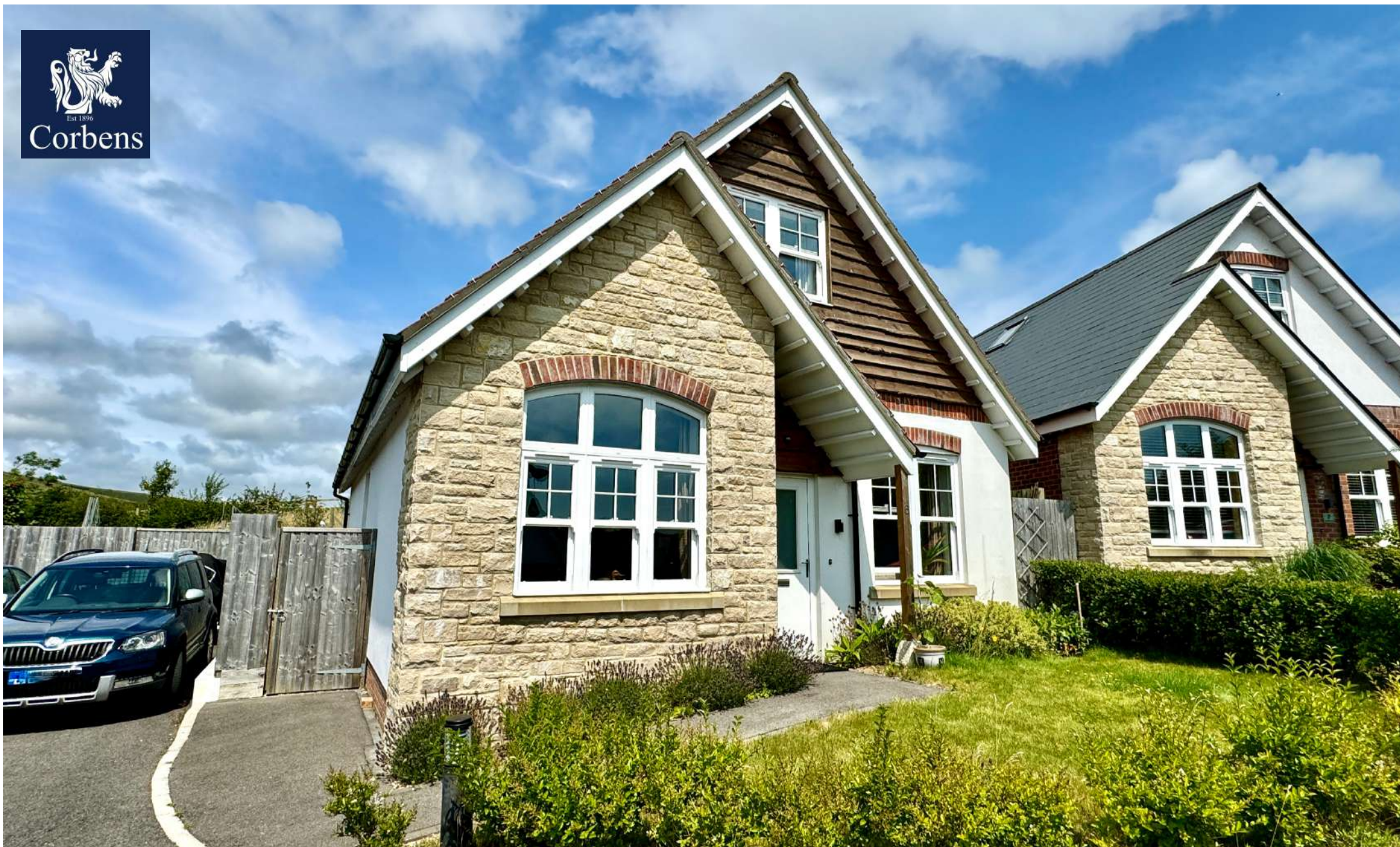
6 SMITHS FARM, SWANAGE £575,000 Freehold