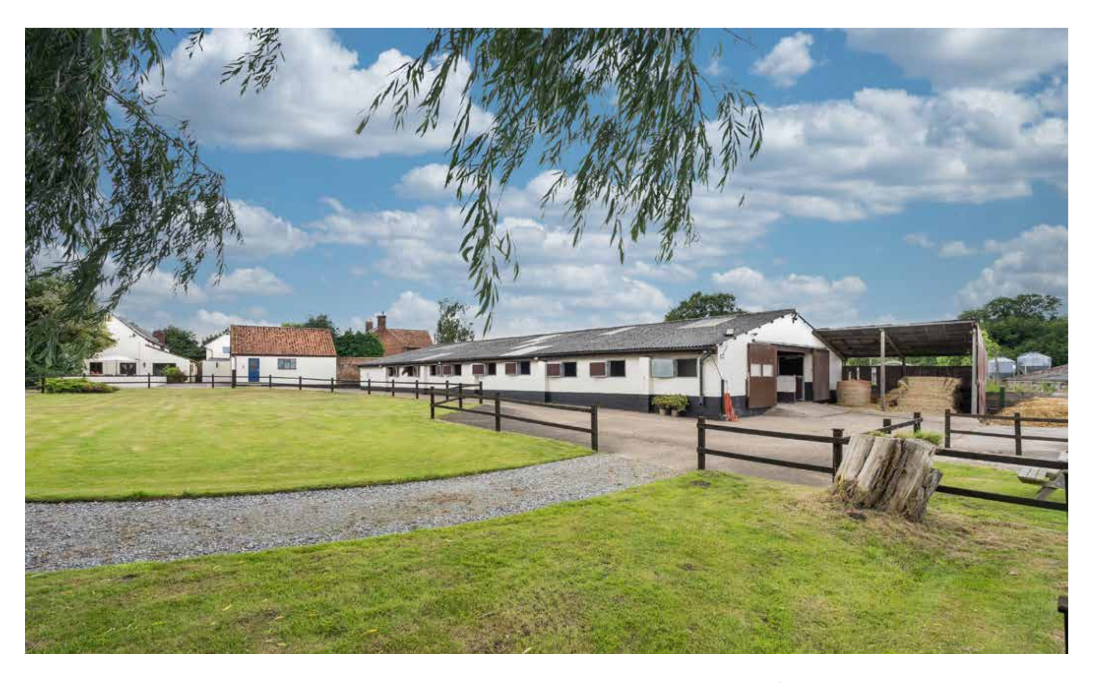
White House Farm Hardley Road | Langley | Norfolk | NR14 6DA