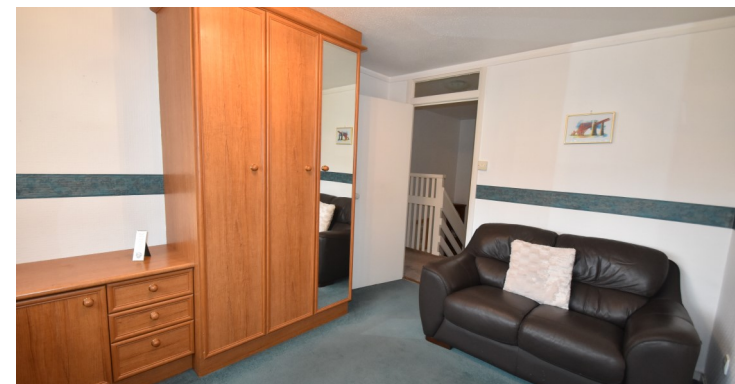
39 Eden Drive