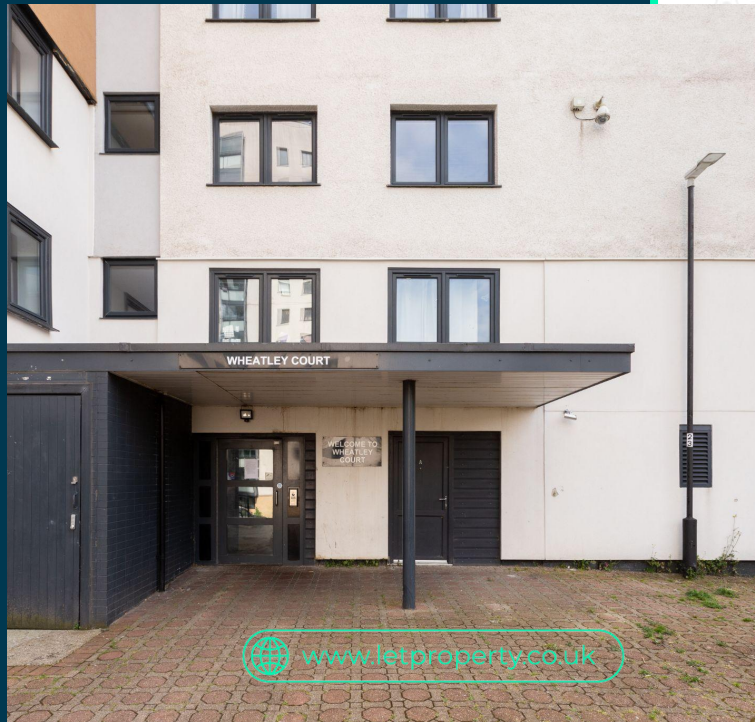
Wheatley Court, Halifax, HX2