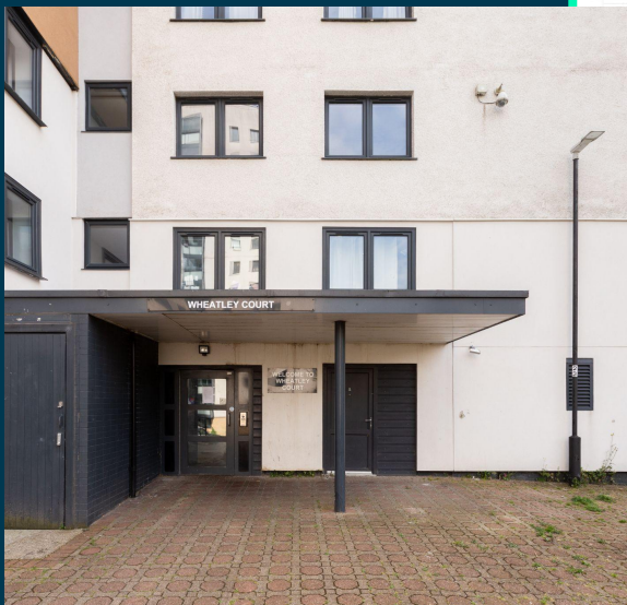
Wheatley Court, Halifax, HX2