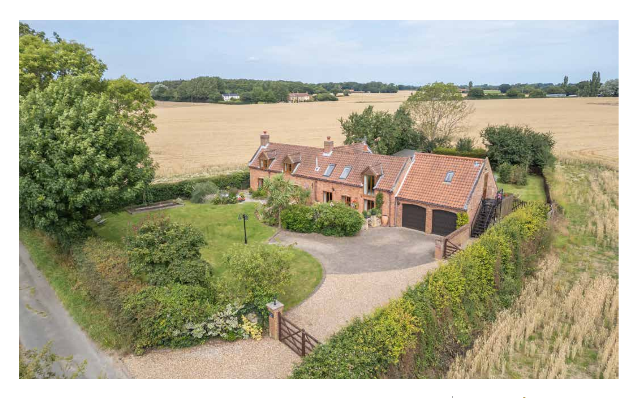
The Old Forge Burrows Green | Aldeby | Norfolk | NR340DH