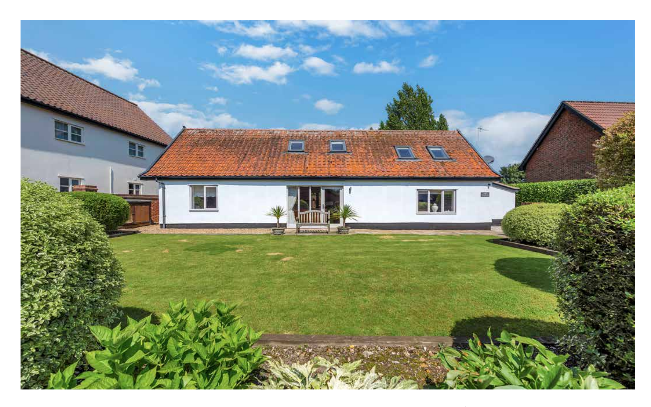
The Stables Meadow Lane | North Lopham | Norfolk | IP22 2FA