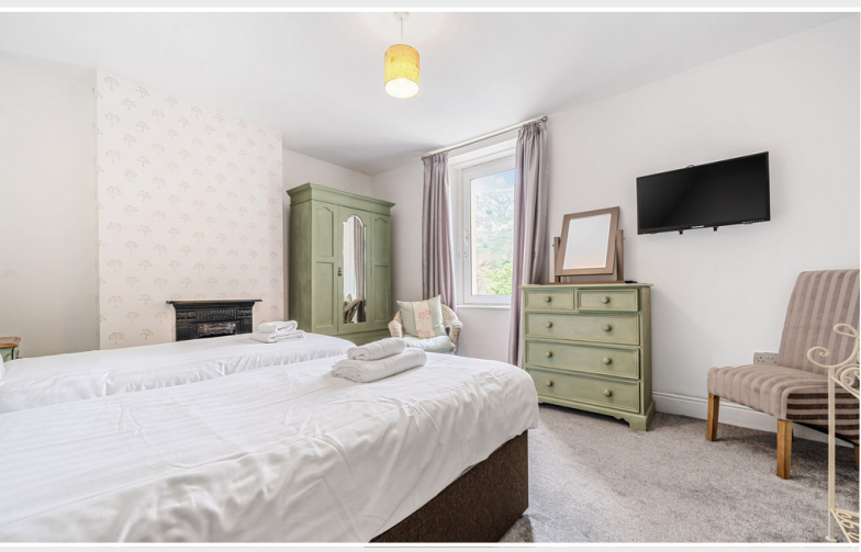
Guest Bedroom 2