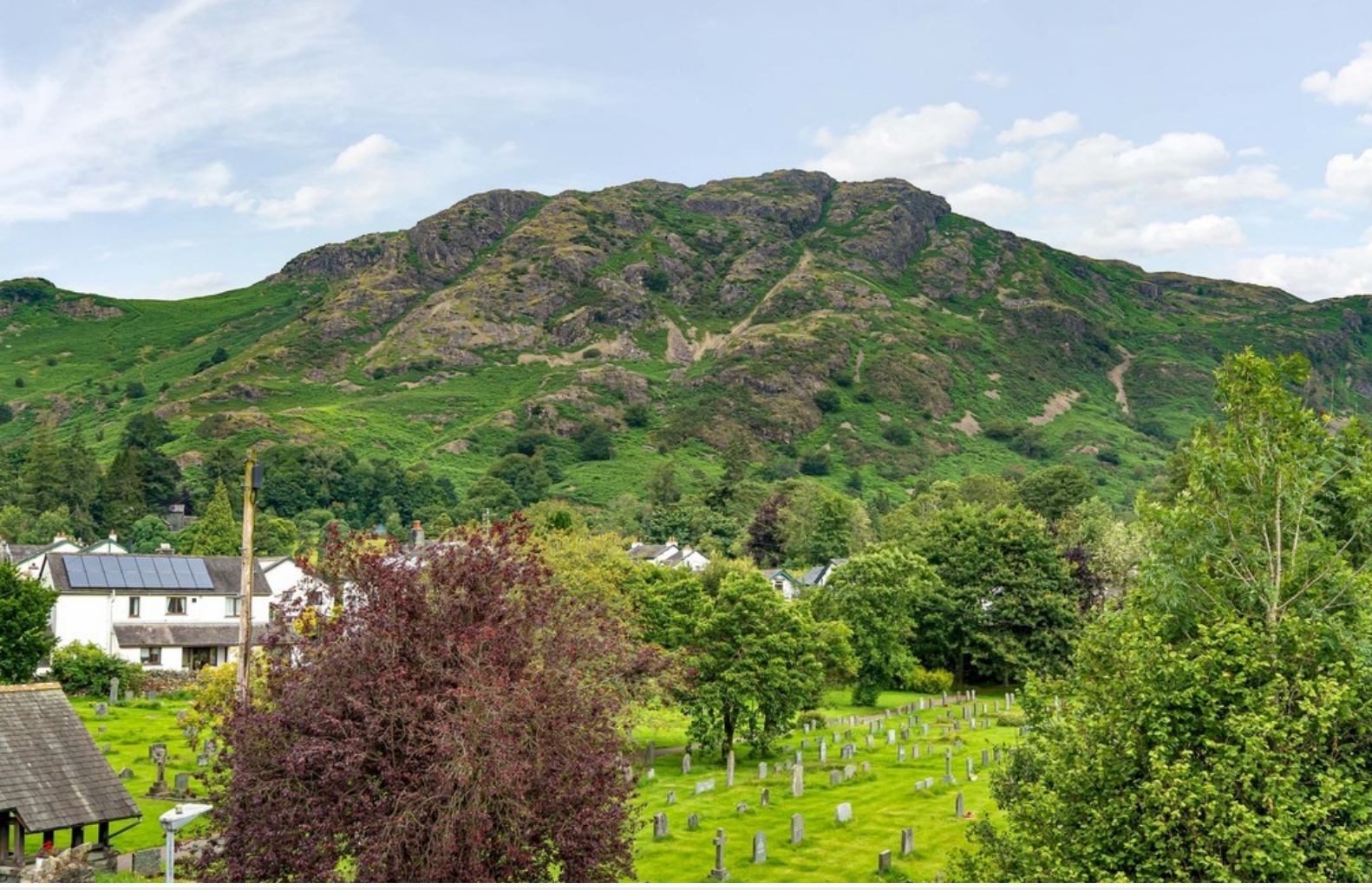
Coniston Fell View