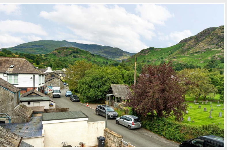
View From Property