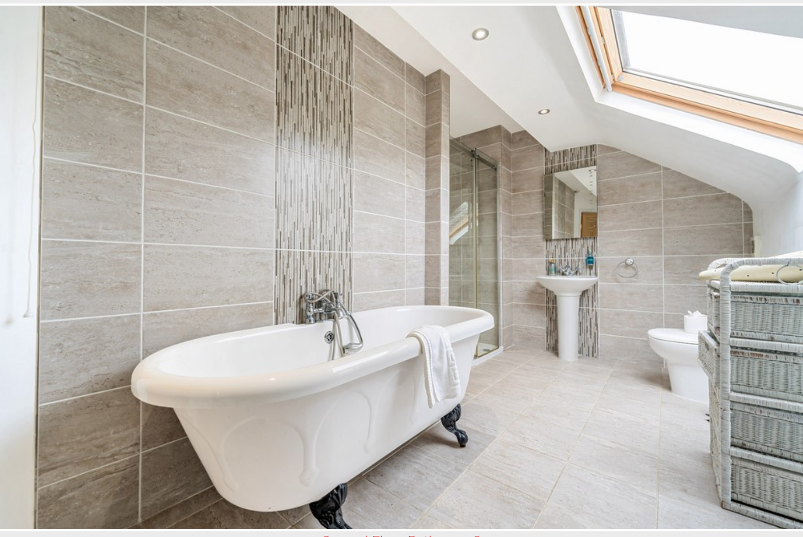
Second Floor Bathroom 2