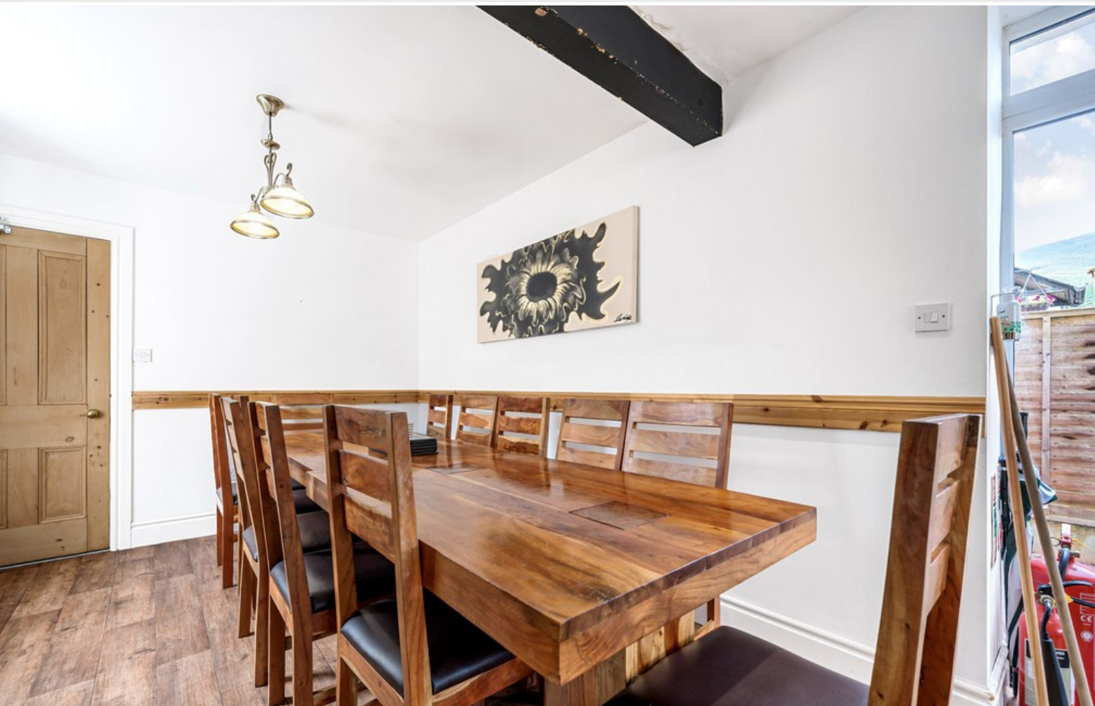
Dining Area In Kitchen