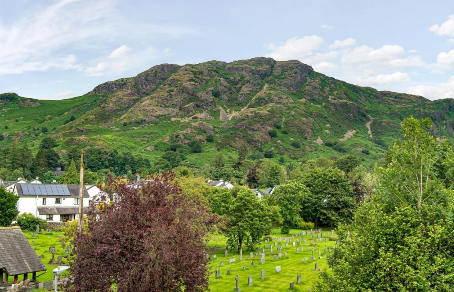
Coniston Fell View