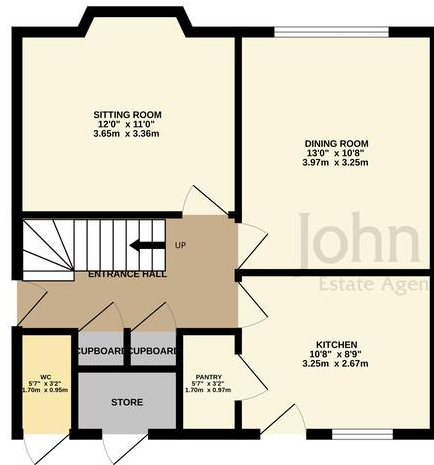
GROUND FLOOR 500 sq.ft. (46.4 sq.m.) approx.