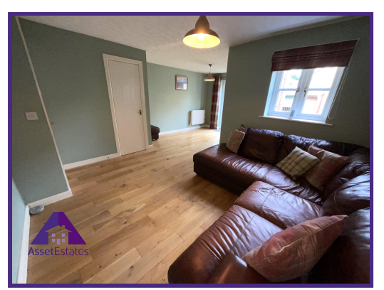
Lakeside Way, Nantyglo, Ebbw Vale, NP23 4EN