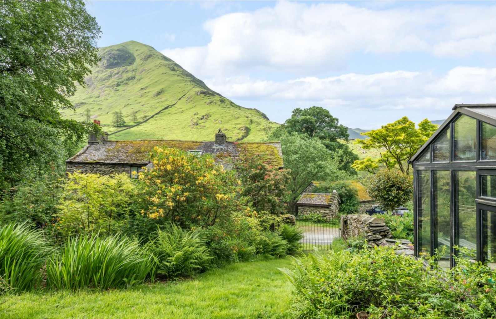
Garden and View