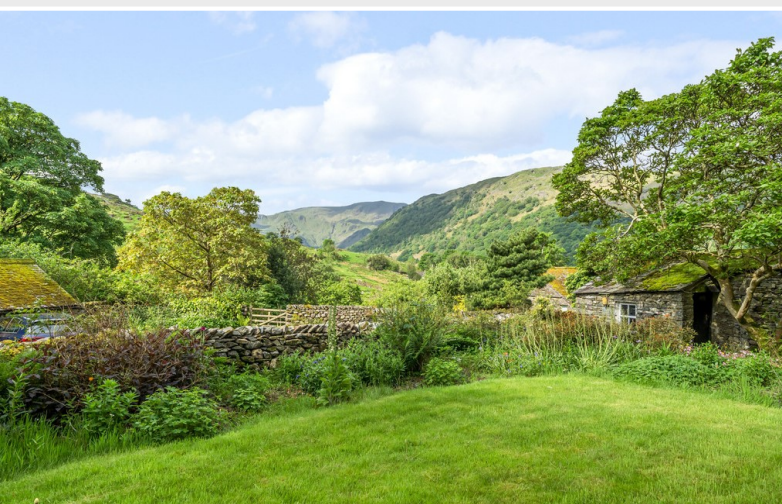
Garden and View

A further second garden area is located across the lane. It has been used for fruit and vegetable growing. With land stretching down to a pretty beck it has vegetable beds, and fruit bushes and trees, including a fruiting fig tree.