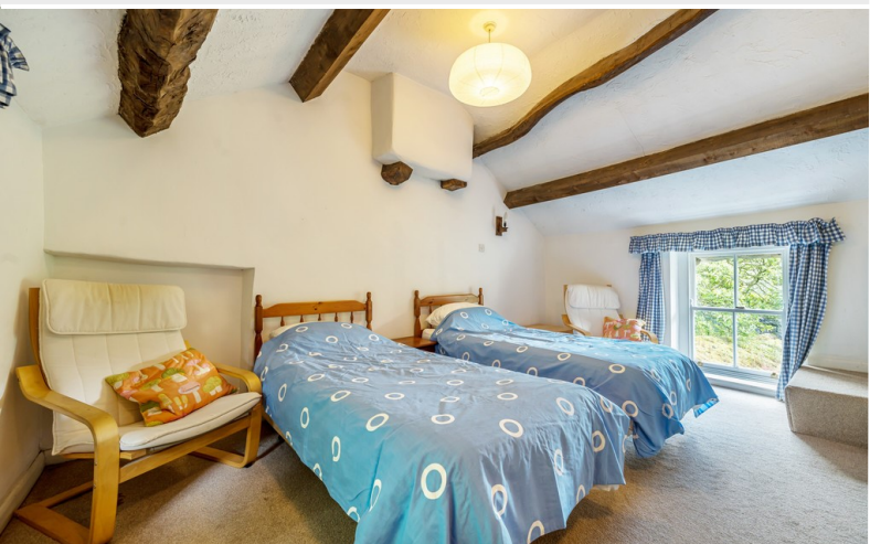
The Cottage - Bedroom

Entering into the breakfast kitchen which is fitted with wall and base units with complementary work surfaces having an inset stainless steel sink unit, ceramic two ring hob, oven and microwave. Additionally there is an Ikea under counter fridge. A rear hallway has an external door to the garden, and the interconnecting internal door to the sitting room in the main house. The bathroom is conveniently also situated on this floor and comprises a three piece white suite. Upstairs is the timber beamed charming double bedroom, bright and cheerful with ample space to sit and take in the glorious fell views.