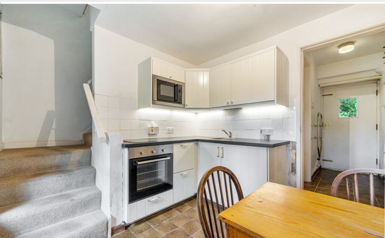
The Cottage - Kitchen