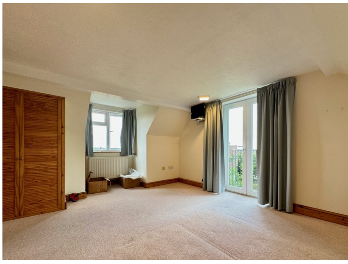
To view this property call Curtis O' Boyle Estate Agents on 01621\ 855558