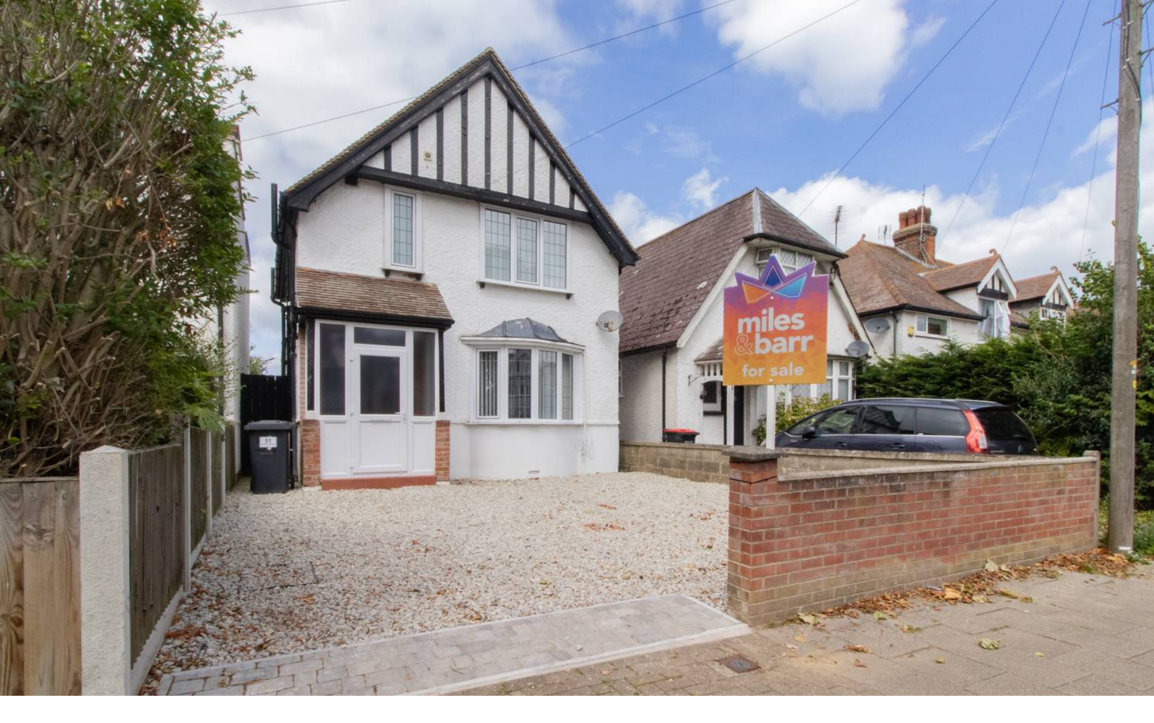
51 Station Road, Herne Bay £450,000