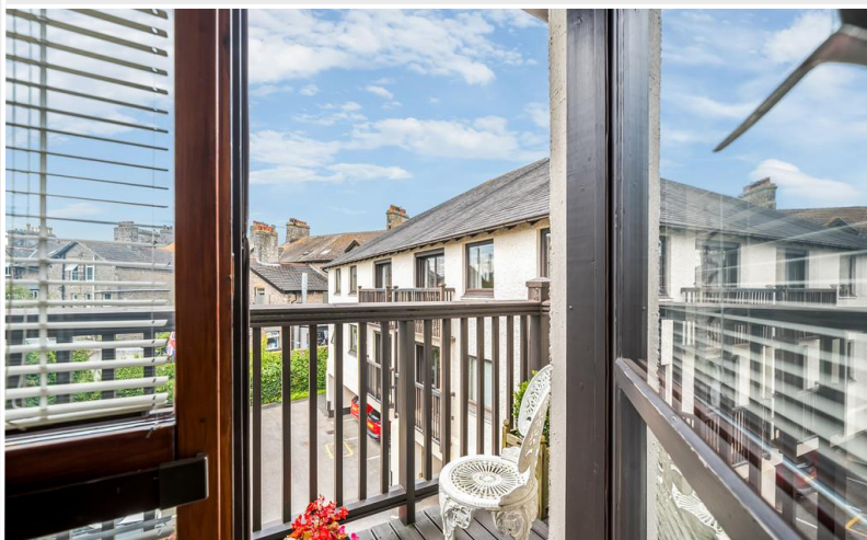
30 Ashleigh Court Balcony