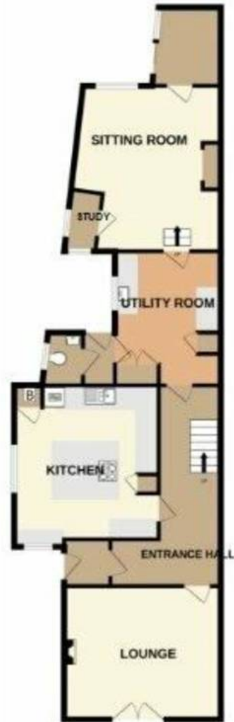
GROUND FLOOR 85.2 sq.m. (920 sq.ft.) approx.