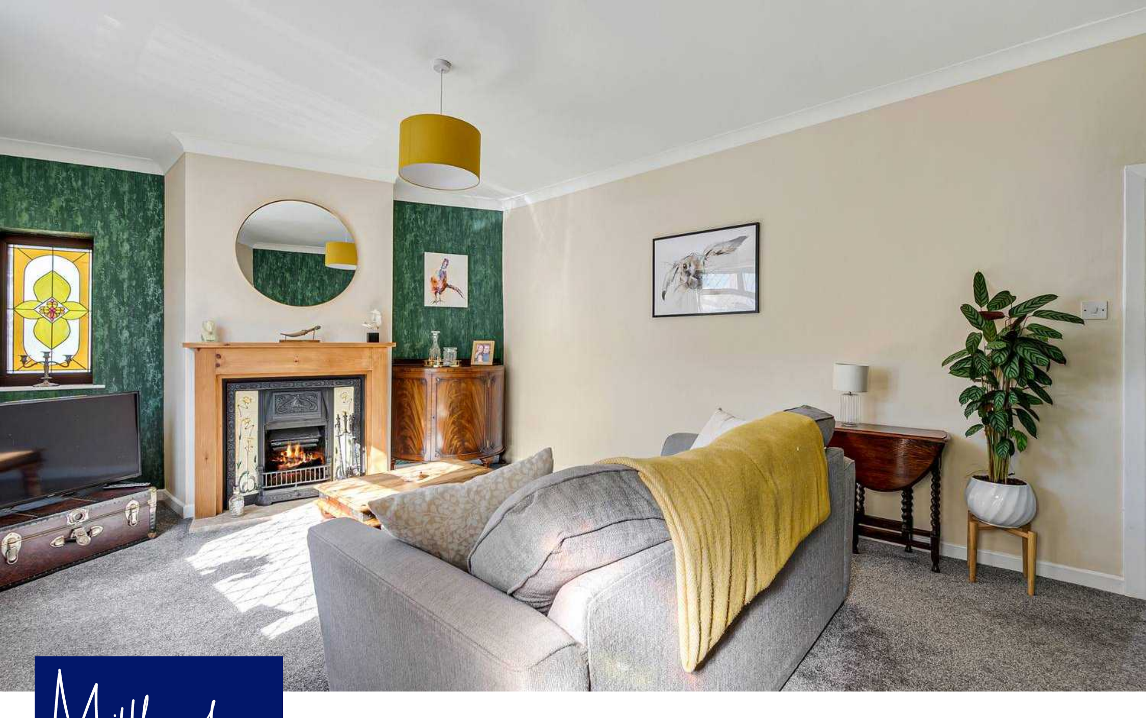
76 Vicars Hall Lane, Worsley £255,000