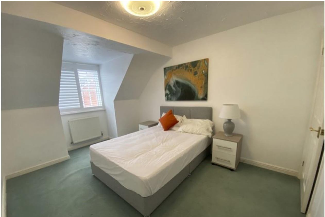
BED, SIDE TABLES, SINGLE FITTED WARDROBE WITH CHEST OF DRAWERS ( FRONT ASPECT)

COMMUNAL BATHROOM - Bath with over shower and glass screen