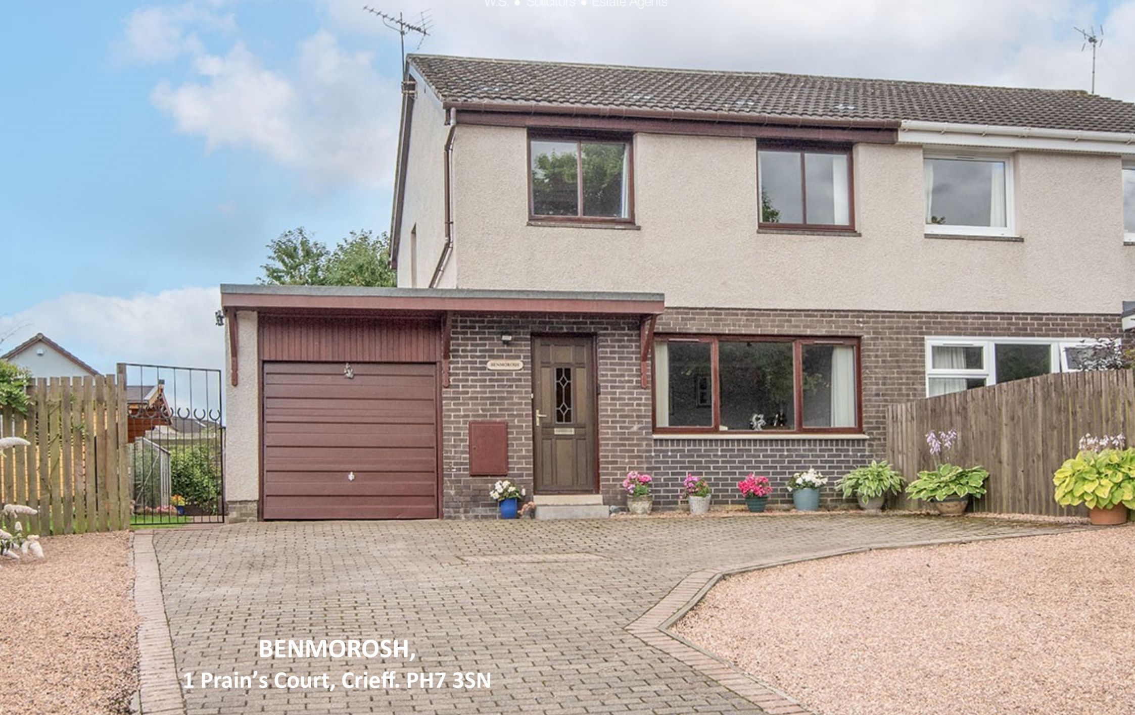
BENMOROSH, 1 Prain's Court, Crieff. PH7 3SN