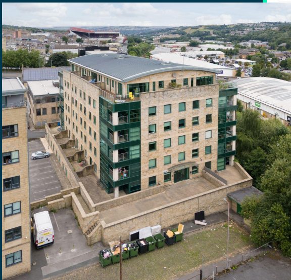
Stone Gate House, Stone St., Bradford, BD1 4QF