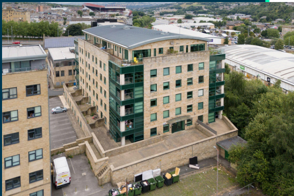
Stone Gate House, Stone St., Bradford, BD1