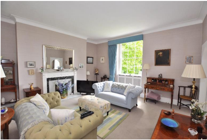
Hill House, Stanmore, continued...