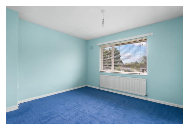
Bedroom Two 11'2" x 10'3" (3.41 x 3.13)