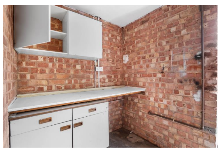
(Please note that this area is absent of plumbing).