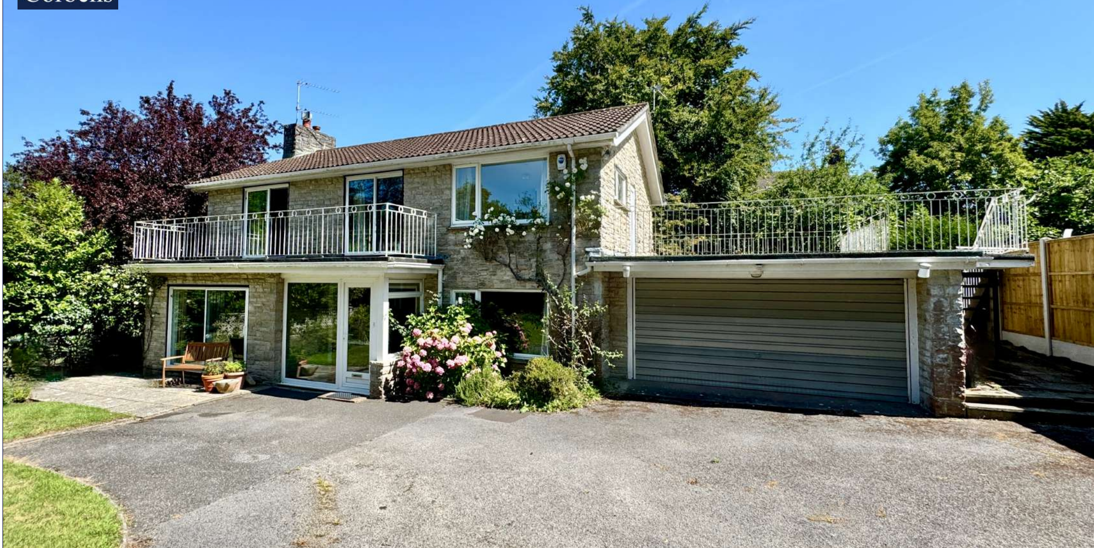
HANDBFAST HOUSE, FERRY ROAD, STUDLAND Guide £995,000