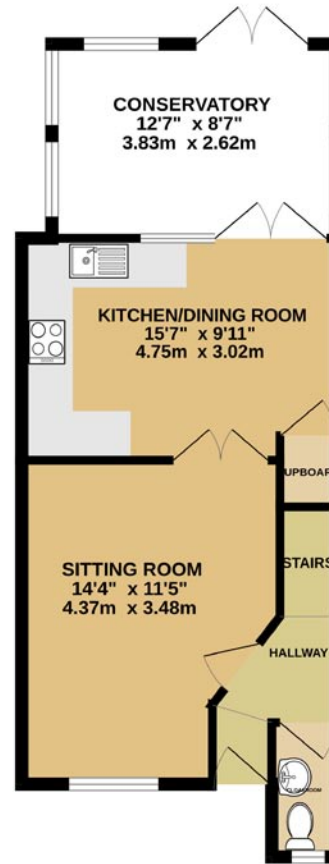
GROUND FLOOR 453 sq.ft. (42.1 sq.m.) approx.