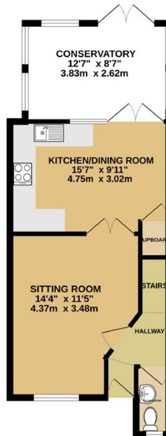
GROUND FLOOR 453 sq.ft. (42.1 sq.m.) approx.