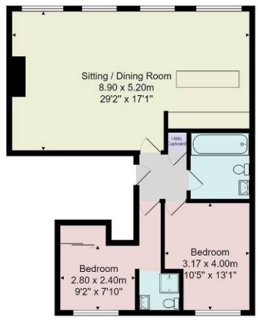
Total Area: 79.4 m² ... 854 ft² All measurements are approximate and for display purposes only. No liability is accepted by either the agency or Box Property Solutions Ltd as to the exact measurements of the rooms. Box Property Solutions Ltd aretains the copyright on this plan and allows agents to use it with agreed permission.