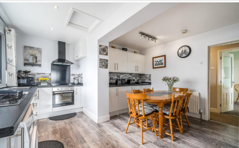
Kitchen Dining Room