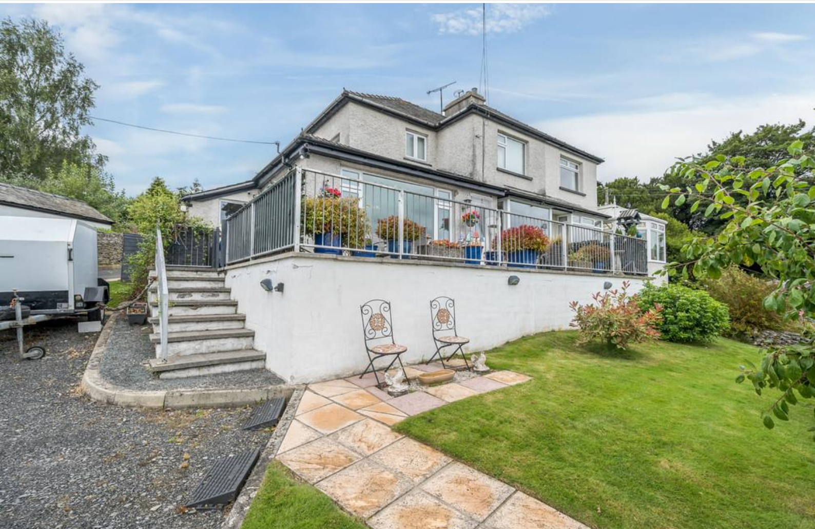
1 Fields View