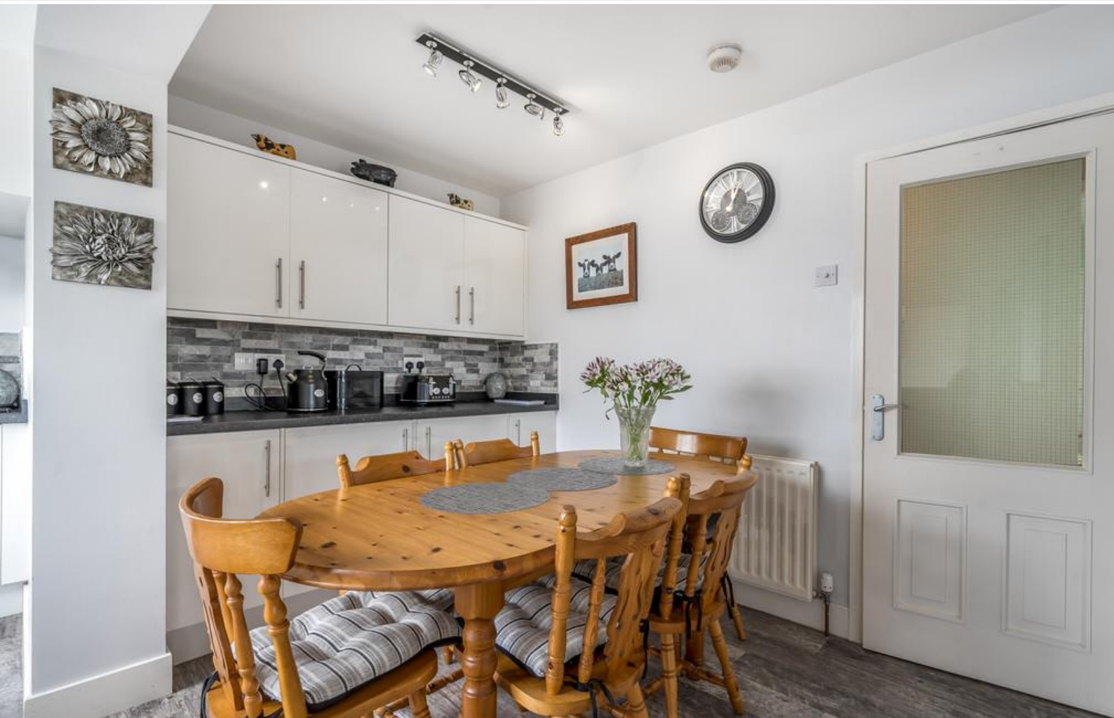
Kitchen Dining Room