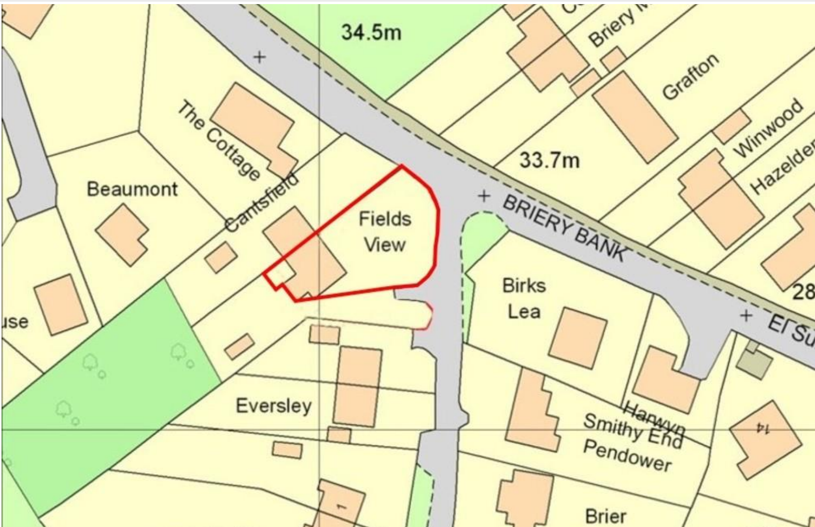
Ordnance Survey 0000851063