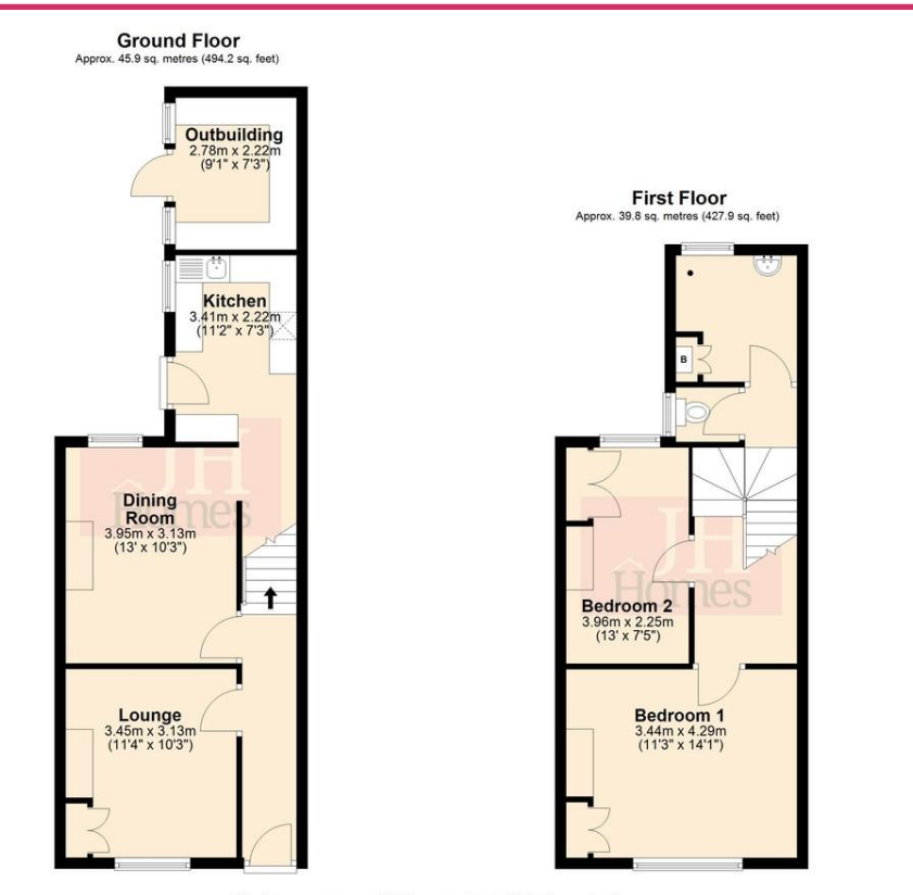
Total area: approx. 85.7 sq. metres (922.0 sq. feet)