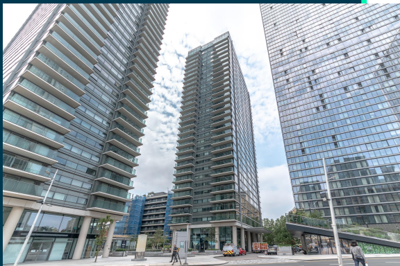
Landmark West Tower, Marsh Wall London, E14