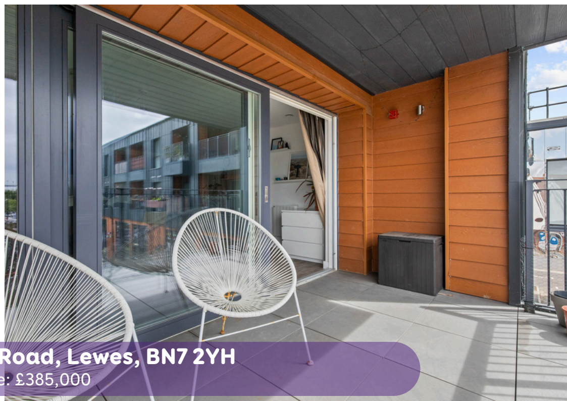
Sketch Place, Brooks Road, Lewes, BN7 2YH Fixed price: £385,000