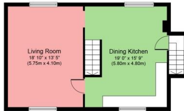
First Floor Approximate Floor Area 509 sq. ft. (47.3 sq. m.)