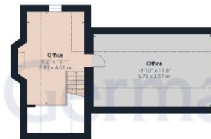
Floor 1 Building 2