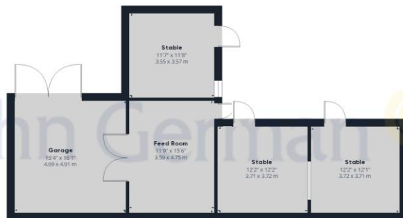
Ground Floor Building 3