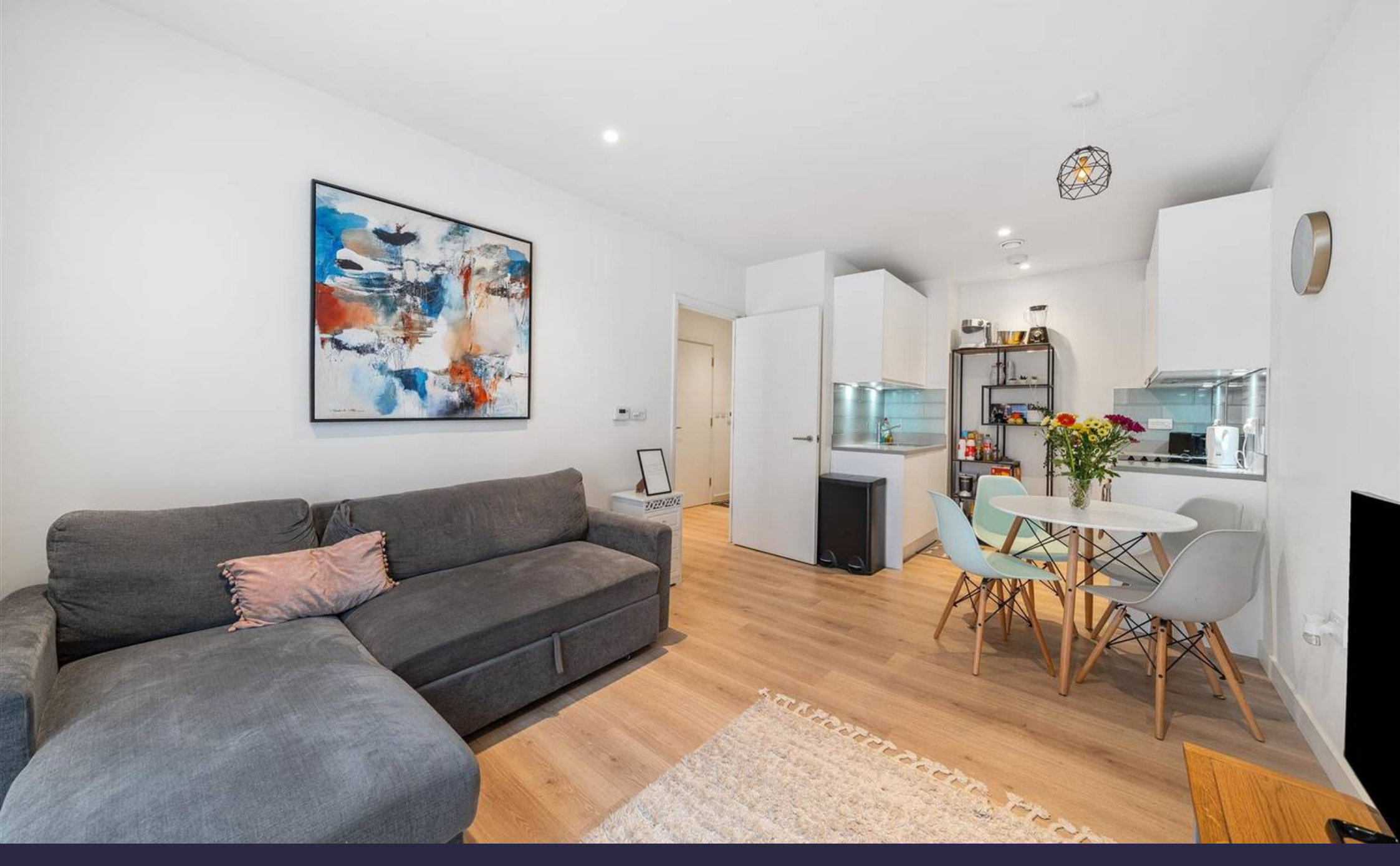
Apt 9, 1 Varcoe Road, London