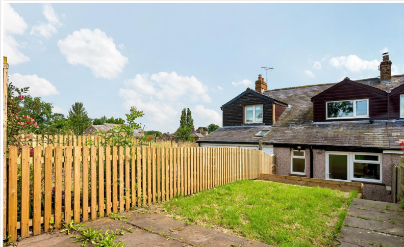
Rear Aspect and Garden