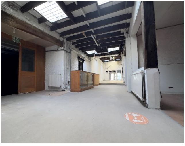
Rent £20,000 per annum