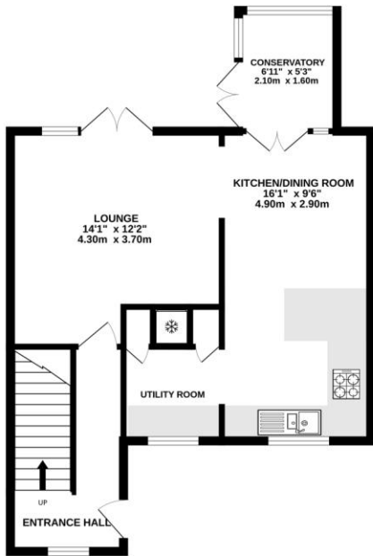
GROUND FLOOR 579 sq.ft. (53.8 sq.m.) approx.