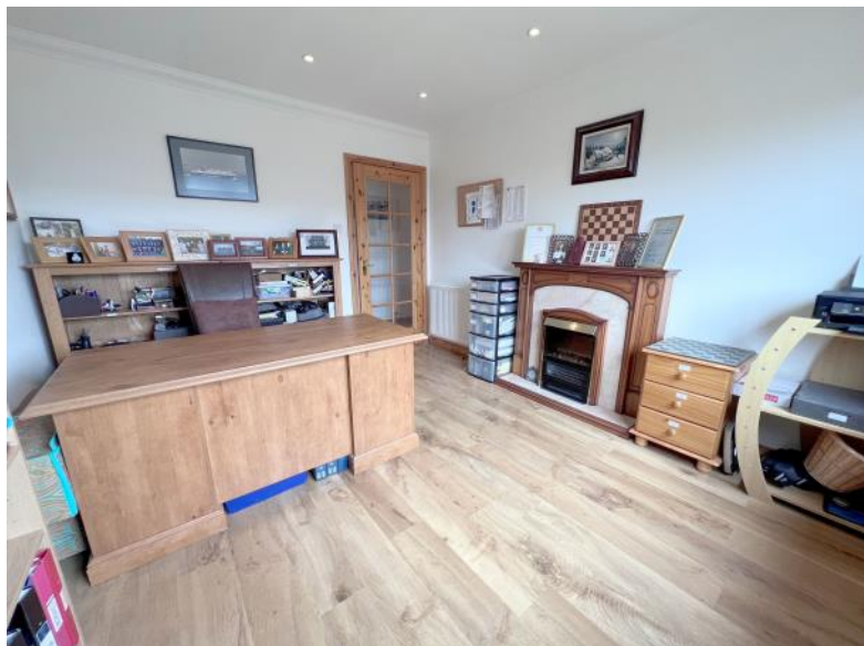
Study (Potential 5th Bedroom)