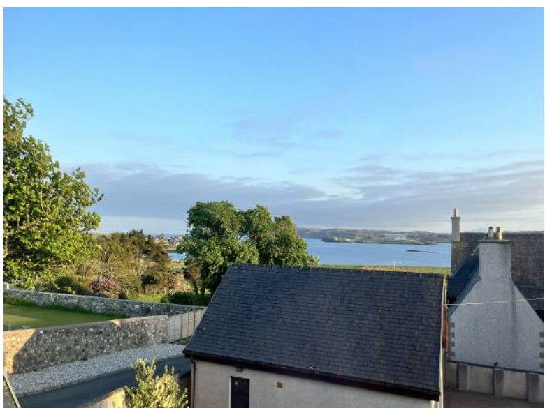
View from First Floor