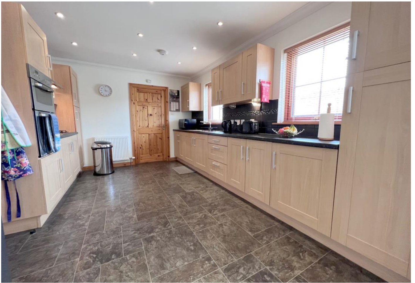
Kitchen & Dining Room