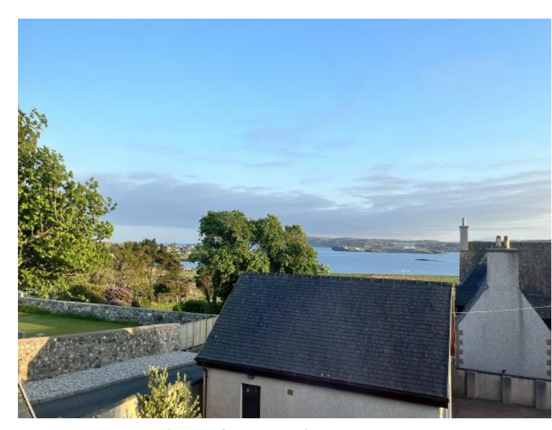
View from First Floor