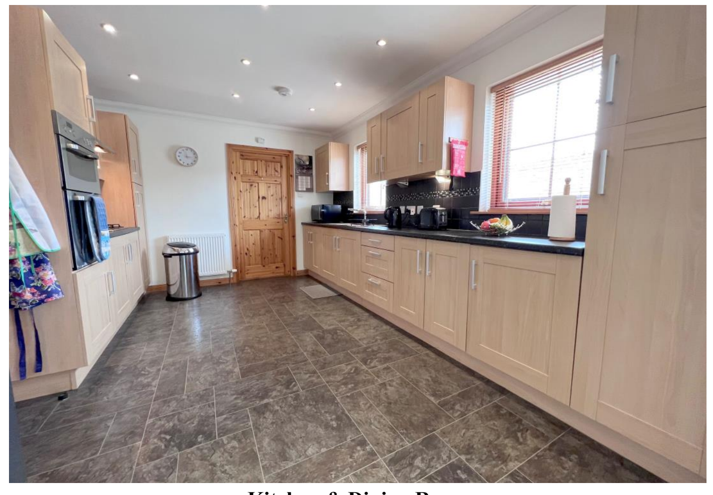
Kitchen & Dining Room