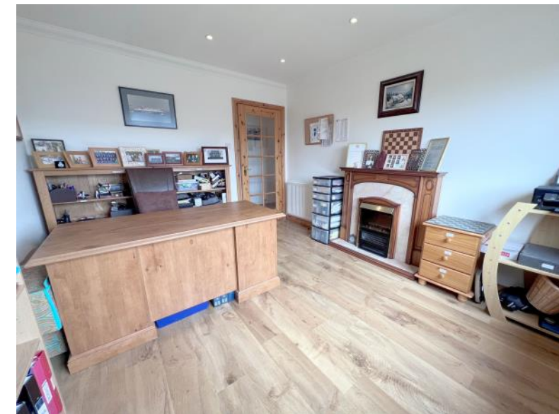
Study (Potential 5th Bedroom)