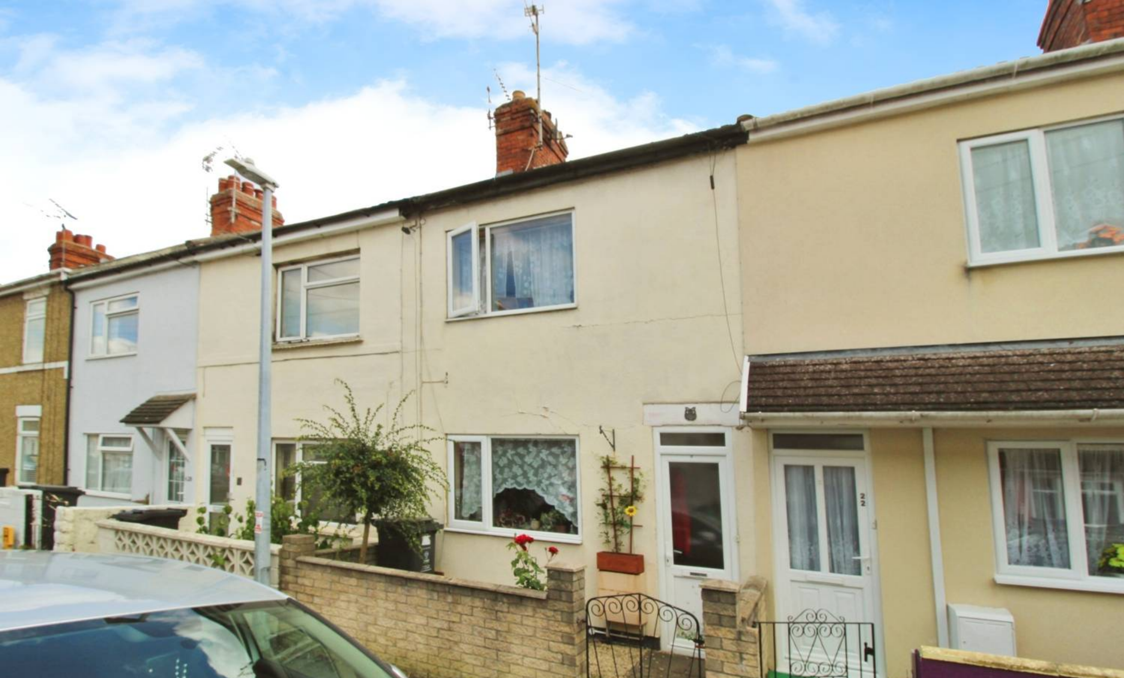
24 Omdurman Street, Swindon Swindon