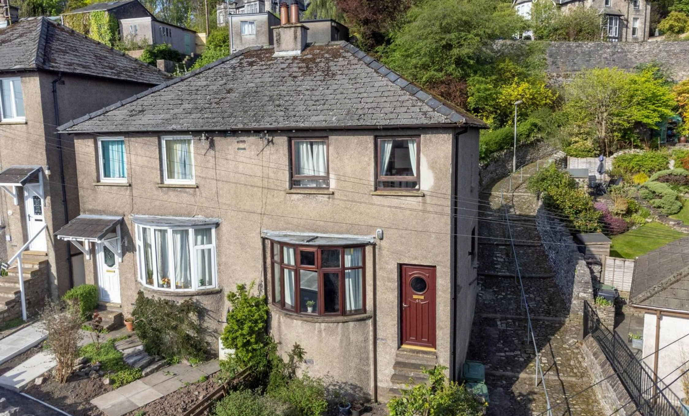
46 Serpentine Road, Kendal £270,000