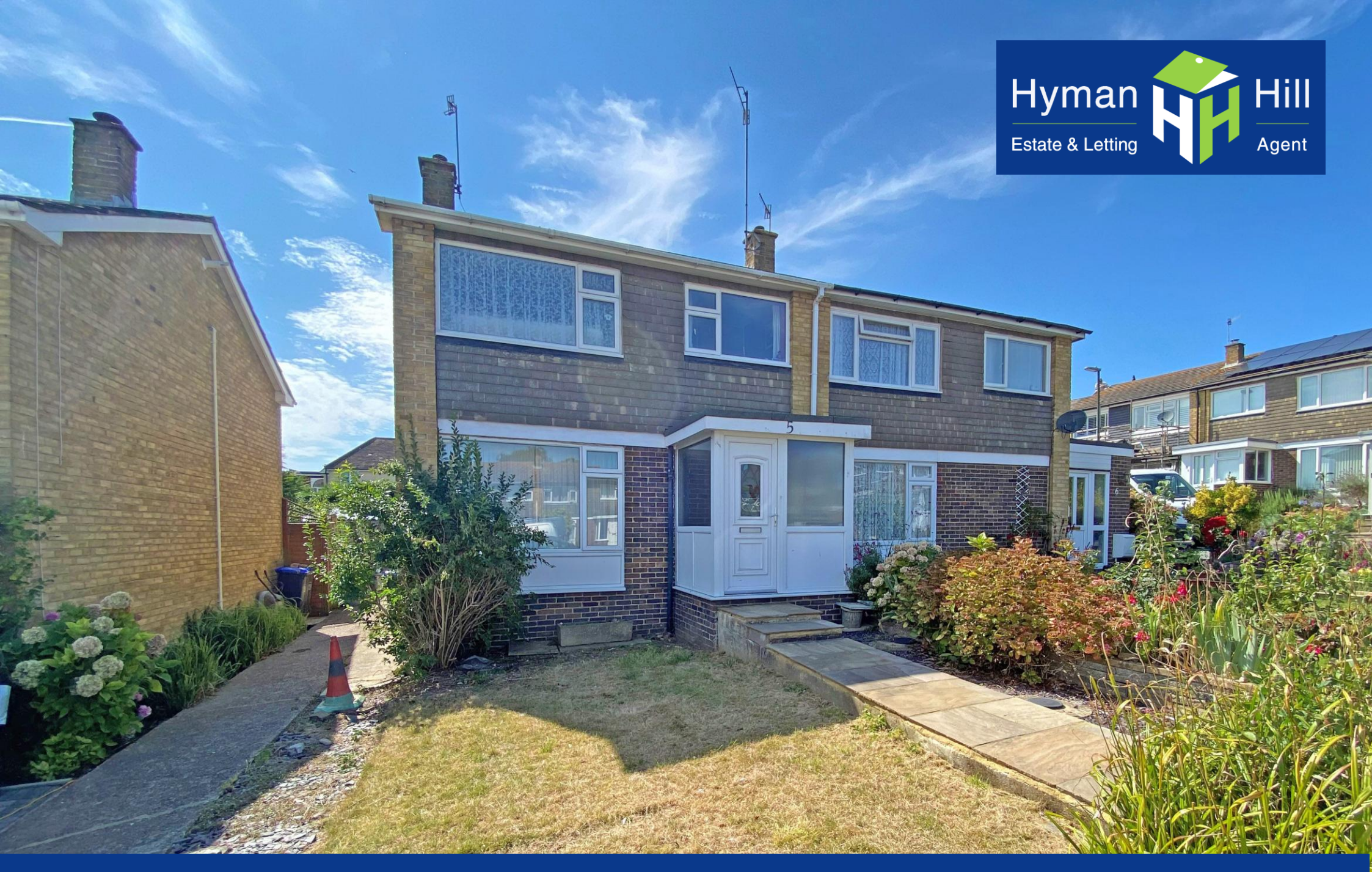
5 Northbourne Close, Shoreham by Sea, West Sussex, BN43 5AP